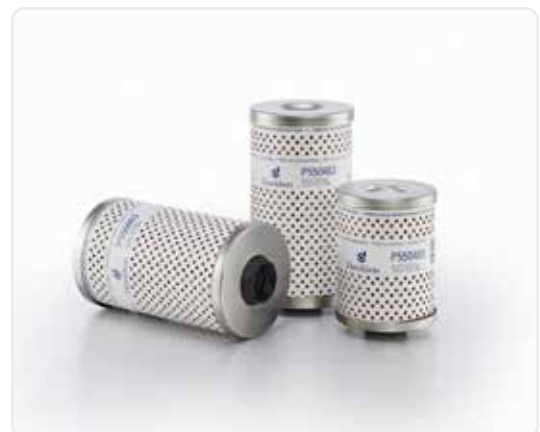
Fuel Pro® 380/382 and 230/232 Filters