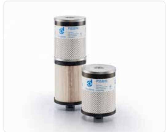
Industrial Pro® FH239 EleMax® Filters