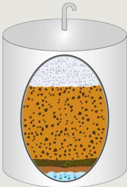
Typical storage tank contaminated with dirt, water, and microbial growth.

Contaminants and water are the enemies of engine fuels and lubricants, robbing vehicles and equipment of performance and longevity.