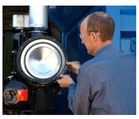
When servicing the EBB, make sure to replace the cover gasket when changing filters.