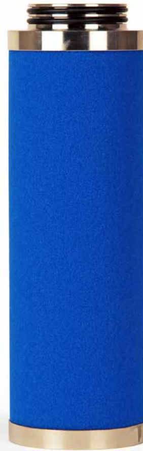
P-FF, P-MF, and P-SMF