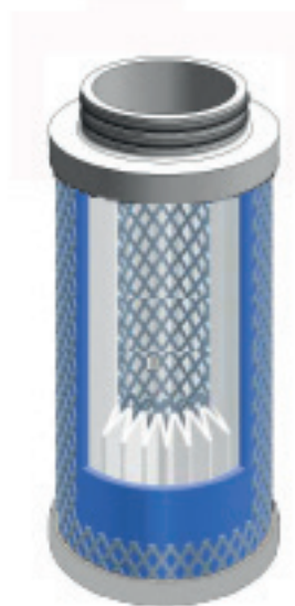
Cross section of the depth filter

The UltraPleat® MFP filter element is designed and developed for the following applications: