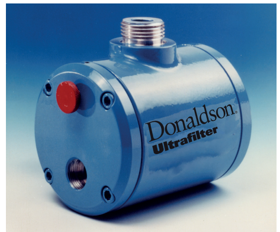
Pneumatic controlled condensate drain UFM-P